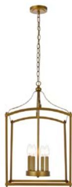
Brass Item No:LD7070D15BR